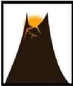
Fiery Mountains and golden sands