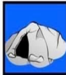
Caves beneath the waves.