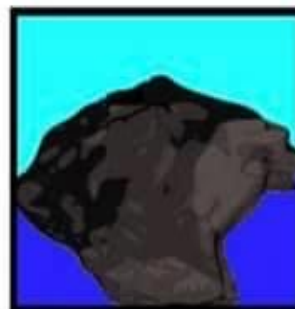
Home again on her rock